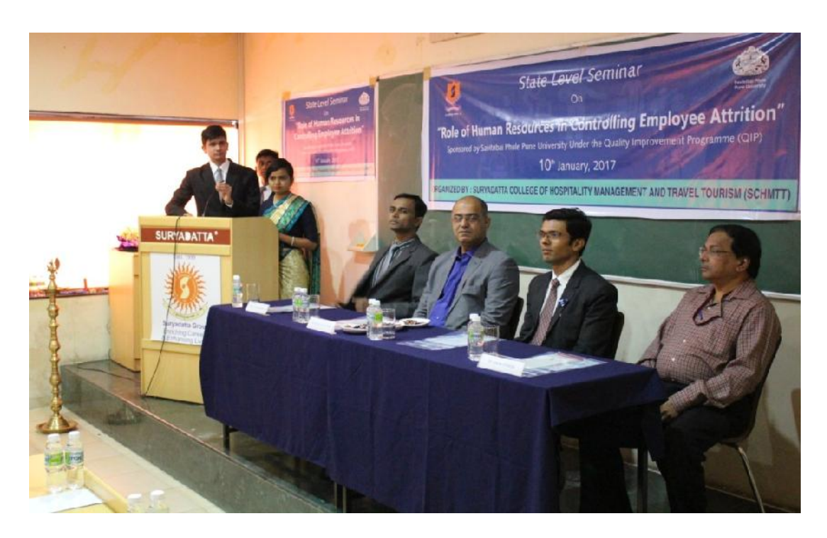
SEMINAR INAUGURATION, CHIEF GUEST WITH KEY NOTE SPEAKERS